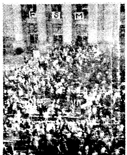
Berkeley FSM Demonstration Administration Shakeup

FSM met on Saturday for five hours with an emergency executive committee of the Academic Senate, a faculty organization. Hope was expressed that an era of peace was an early prospect.