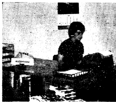
Office work in Europe is interesting

In February a bill may become law without the Governor's signature.