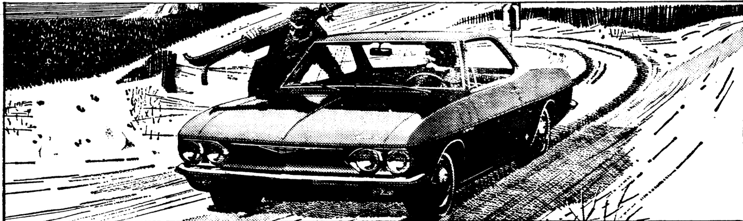
CORVAIR - The only rear engine American car made. Corvair Corsa Sport Coupe

When you take in everything, there's more room inside this car than in any Chevrolet as far back as they go. It's wider this year and the attractively curved windows help to give you more shoulder room. The engine's been moved forward to give you more foot room. So, besides the way a '65 Chevrolet looks and rides, we now have one more reason to ask you: What do you get by paying more for a car—except bigger monthly payments?